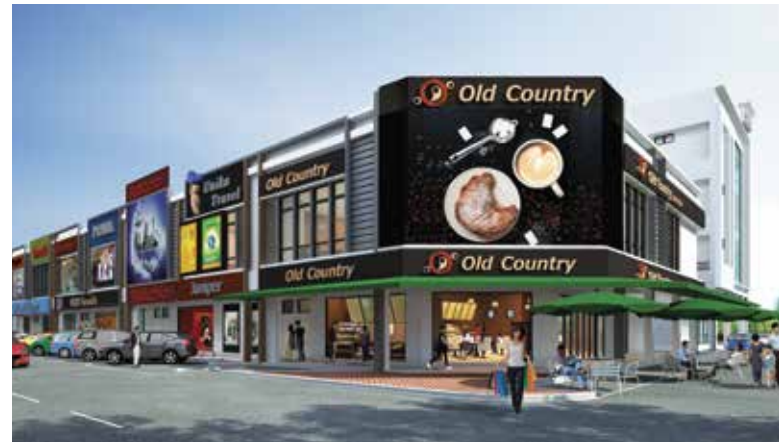
Situated in Kota Masai, a mega township with a myriad of mature residential areas.

Enjoyable by several mature neighbourhoods.