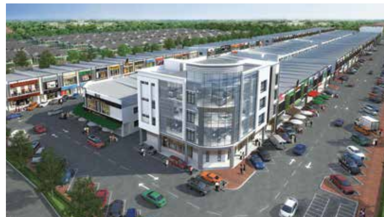
Built fronting the main road for optimum and maximum visibility.