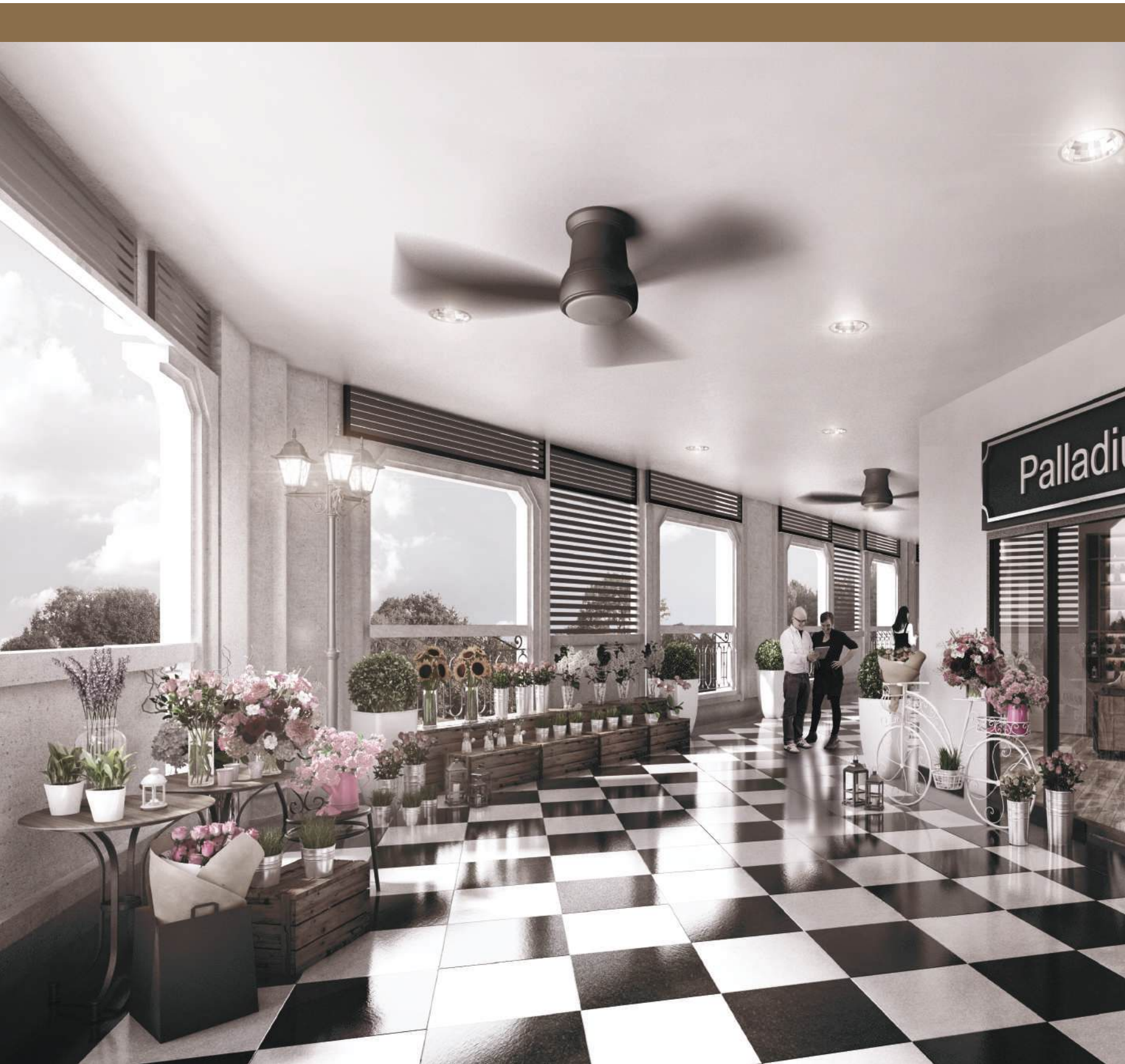
1 st floor units boast double frontages which open to spacious walkways for elaborate displays to attract shoppers.