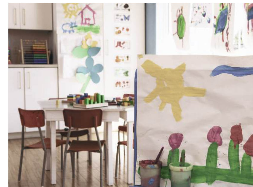
2 nd and 3 rd floor units are suitable for a variety of service-oriented businesses, such as childcare centres and beauty salons.