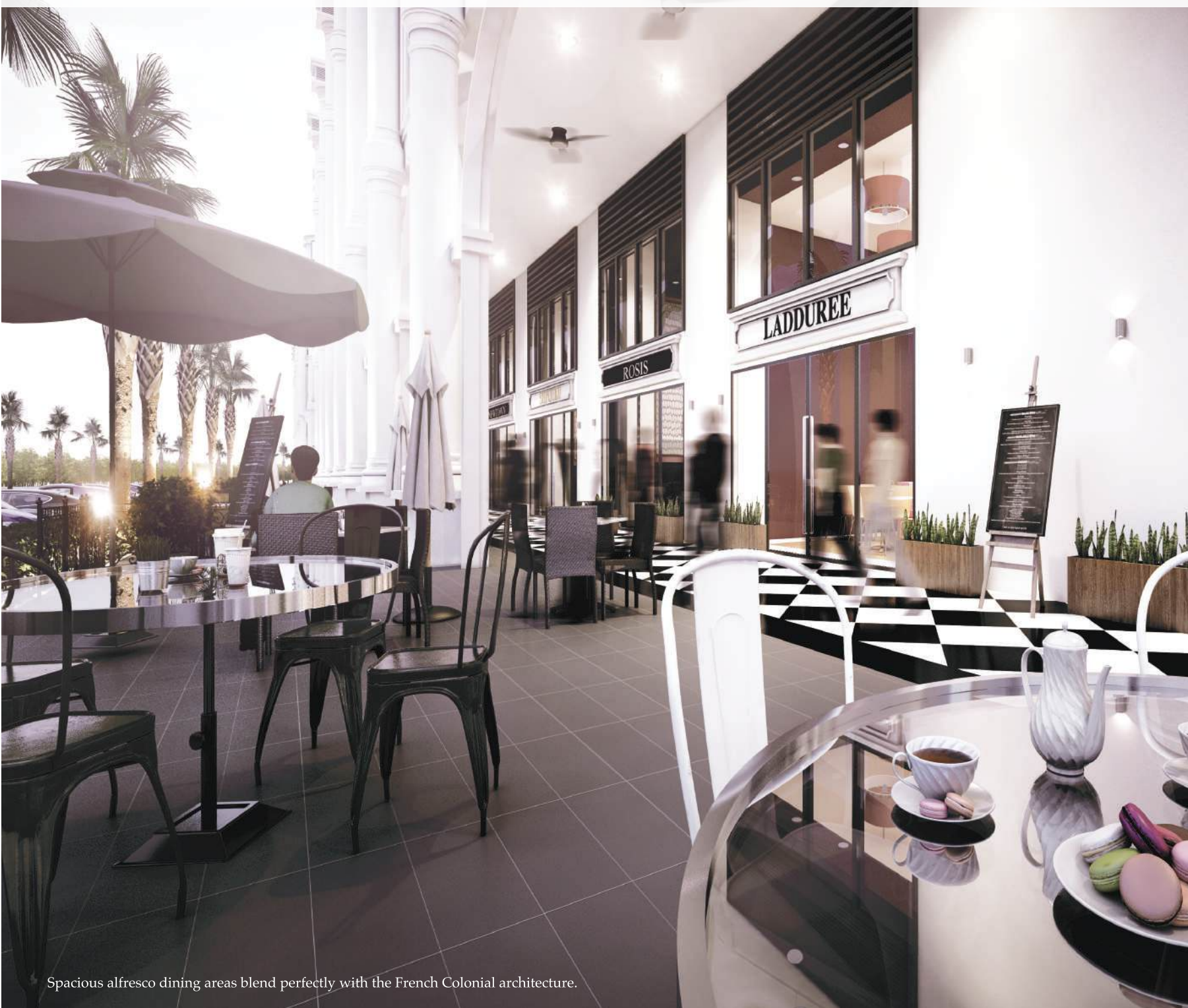
Spacious alfresco dining areas blend perfectly with the French Colonial architecture.