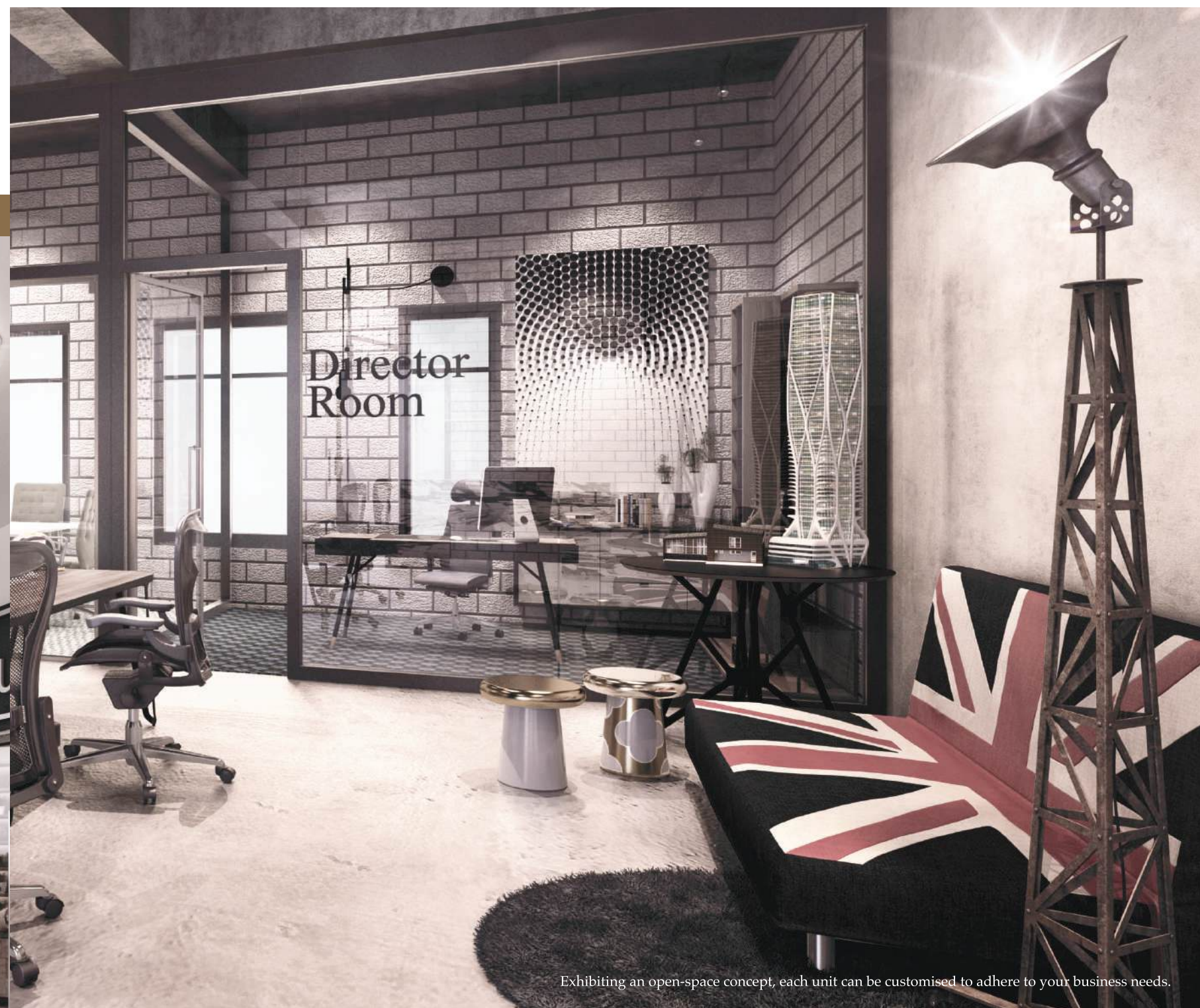
Exhibiting an open-space concept, each unit can be customised to adhere to your business needs.