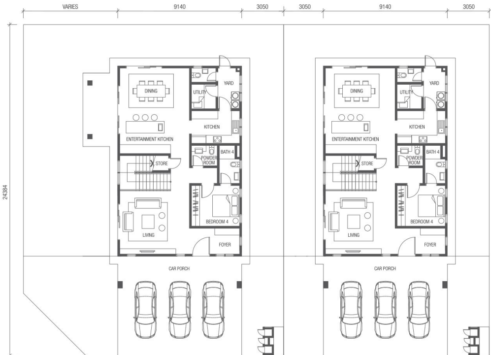
CORNER / END