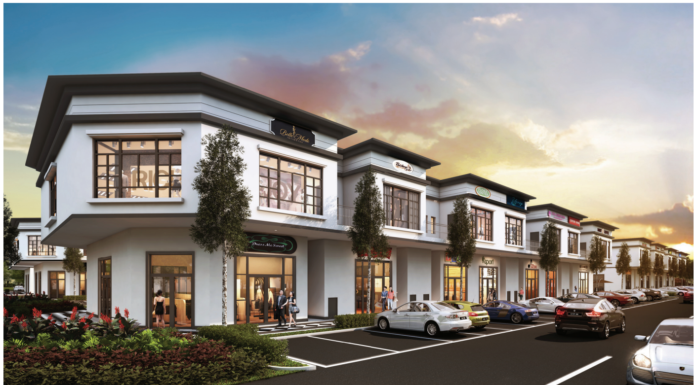
2-Storey Shop-Offices (Dual frontage) 24' x 70' • 3,348 sq. ft.